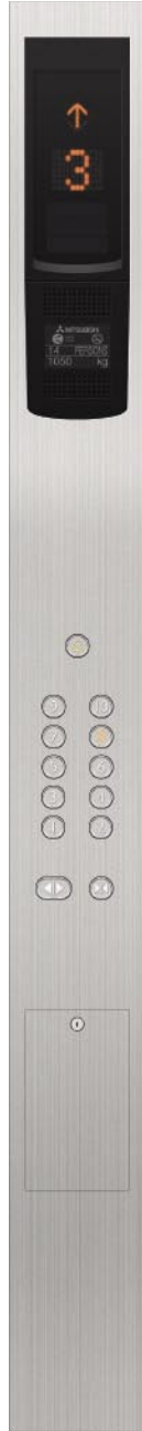
CBV-C240 (CBV-C290) *3