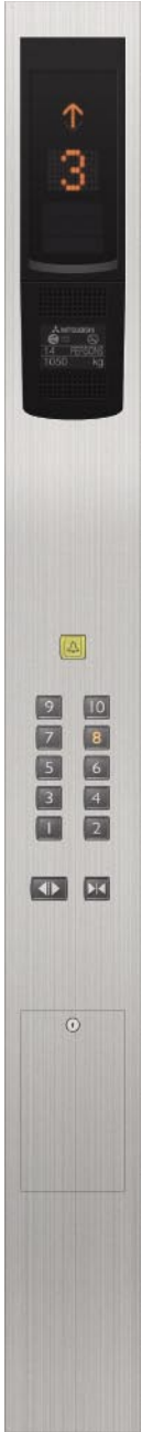
CBE-C240 (Standard) (CBE-C290) *3