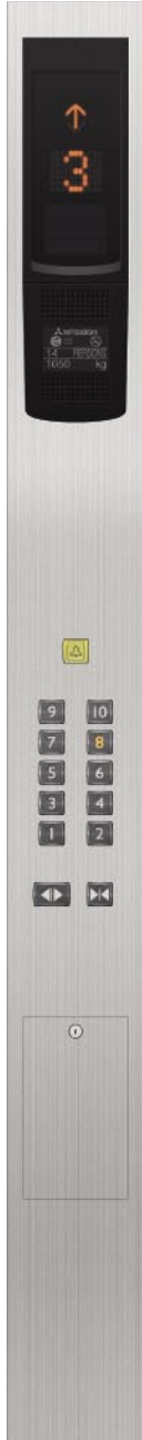
CBF-C240 (CBF-C290) *3