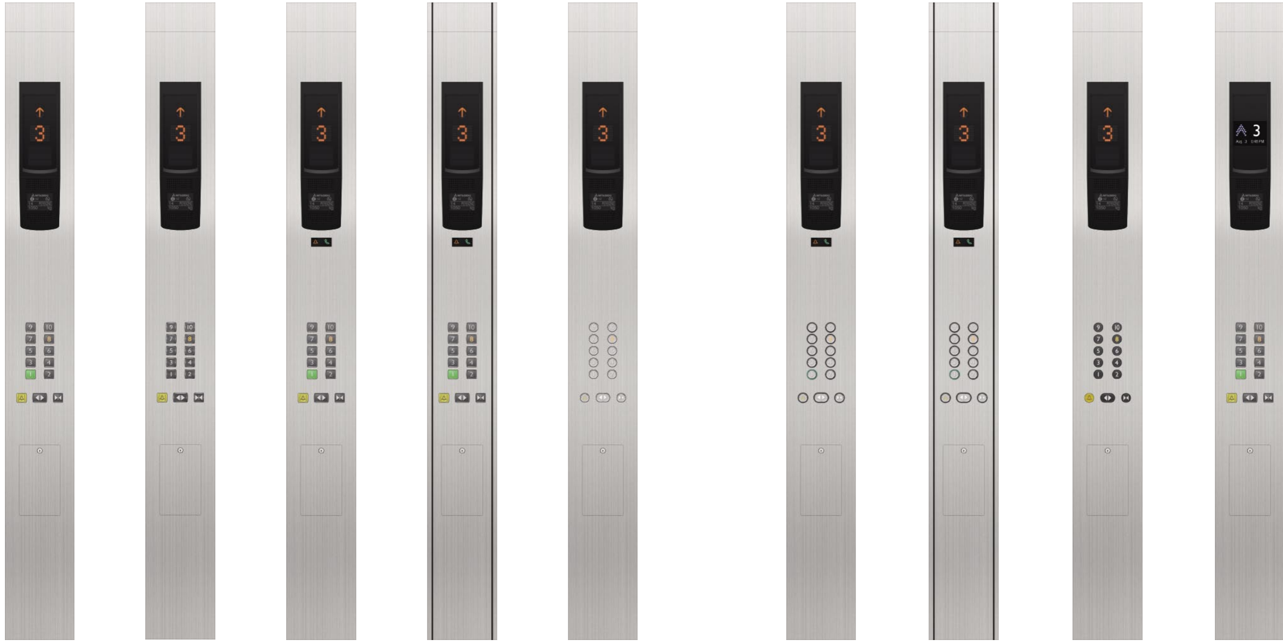
CBE-N211 (CBE-N261) *4