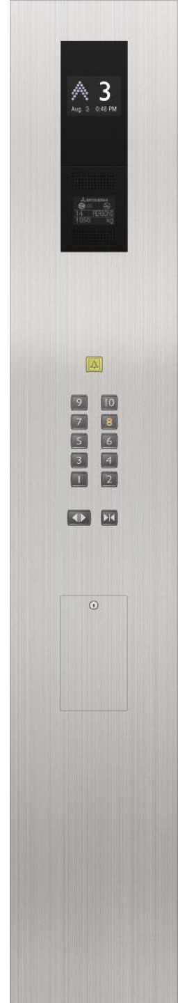
(Swing type) CBE-D221 (CBE-D281) *3